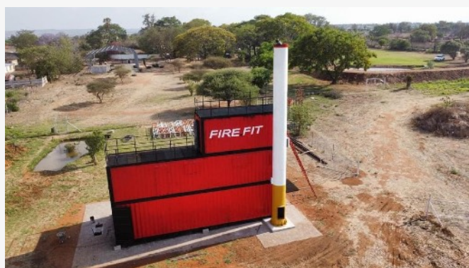
POLOKWANE TRAINING CENTRE

Fire 2 entry requirement is Fire 1 certificate. Hazmat Operations entry requirement is Hazmat awareness certificate.